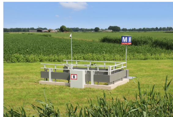
Metro Station Eekteweg (2018)